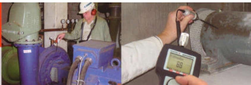
First signs of wear in sliding or rolling bearings are easily detected using body sound detection technology.