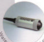
Waterproof body sound probe