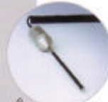
Body sound probe