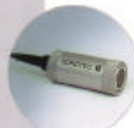
Air sound probe