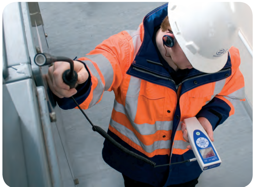
Optional external microphone extends reach.