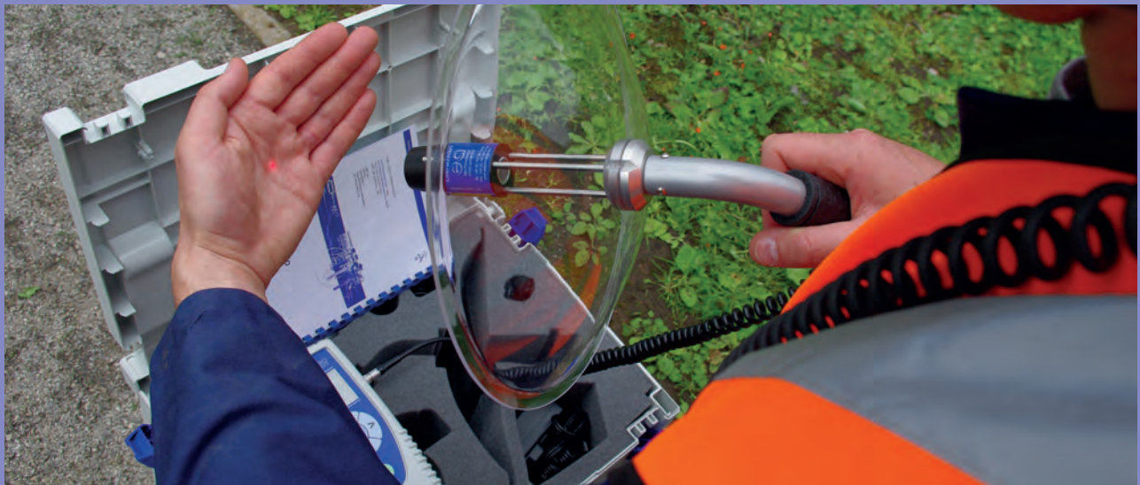
The UltraDish™ has a precision laser sight built in.